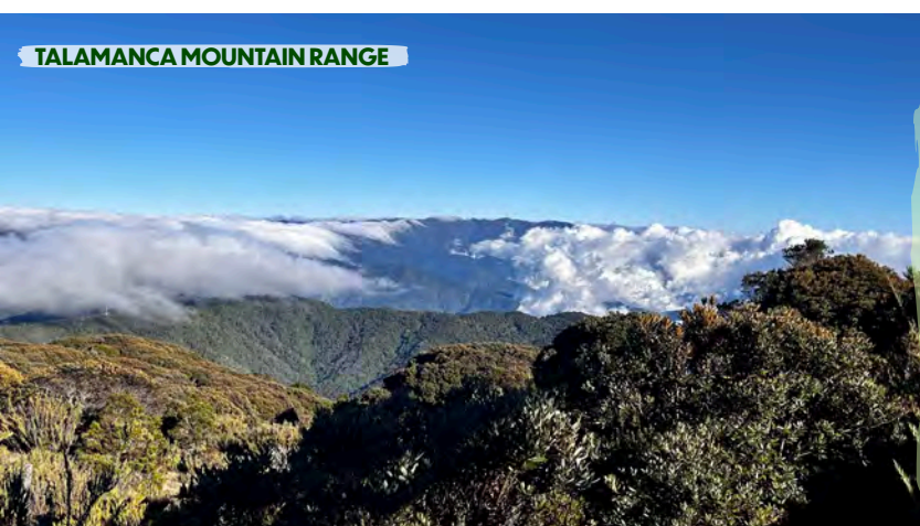
TALAMANCA MOUNTAIN RANGE

The Talamanca Mountain Range, located in southern Costa Rica and extending into western Panama, is one of Central America's most ecologically significant regions. It features rugged terrain, diverse ecosystems from tropical rainforests to cloud forests, and the highest peak, Mount Chirripó, at 12,530 feet (3,820 meters). This range is a sanctuary for many endemic species and offers breathtaking views of both the Caribbean Sea and the Pacific Ocean on clear days.