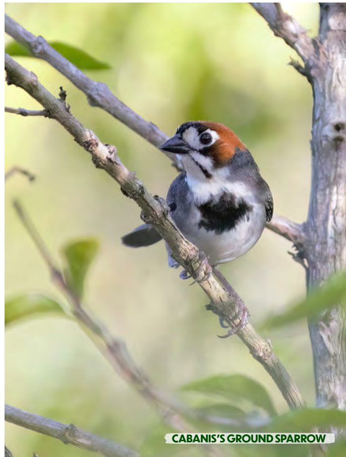
CABANIS'S GROUND SPARROW